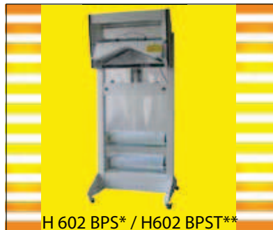
H 602 BPS* / H602 BPST**