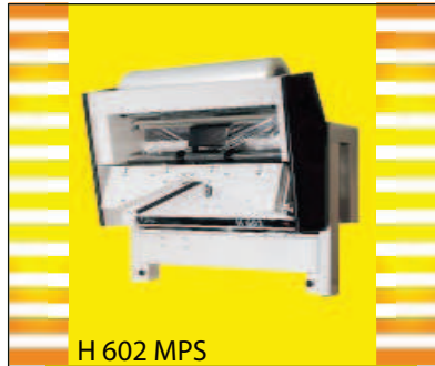
H 602 MPS

**time delay closing system that free the operator's hands