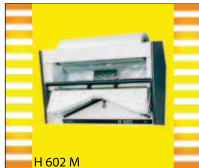
H 602 M