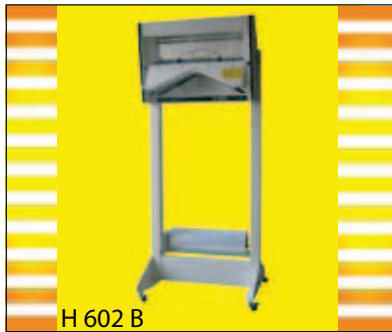
H 602 B