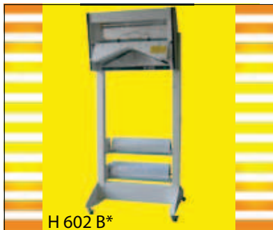
H 602 B*